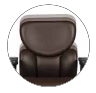
Back & Lumbar area are height adjustable on ratchet system. Position lumbar area for user comfort.